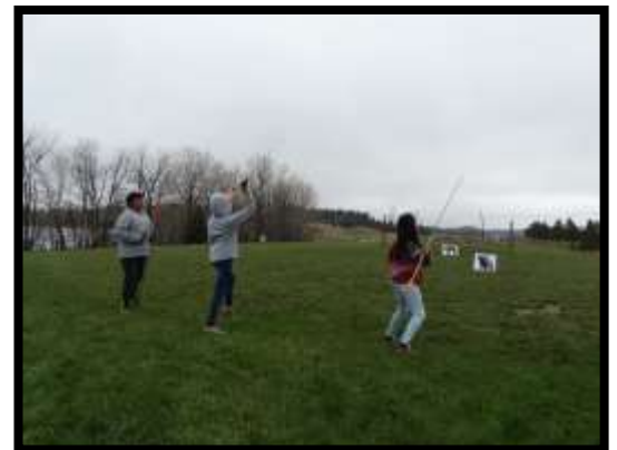
Cul tural Resources