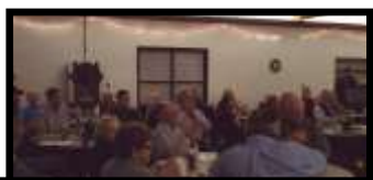
A wonderful mix of producers and community members from both Conservation Districts