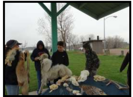
Wil dl ife